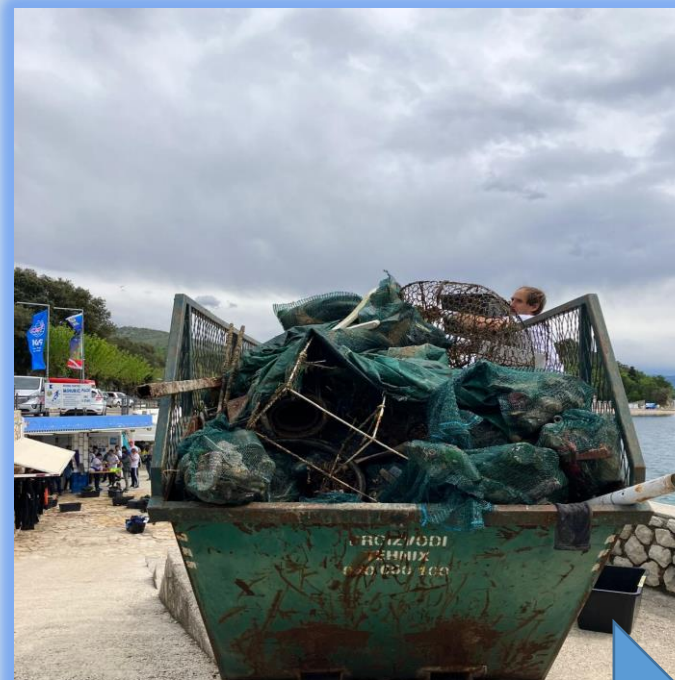
Collected waste around and on the beach – clean-up action, Selce, April 2024

BEACHES ARE OFTEN TARGETED FOR ILLEGAL DUMPING DUE TO THEIR REMOTE LOCATIONS AND LACK OF REGULAR MONITORING!